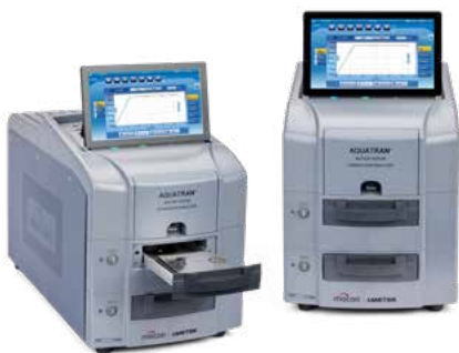
Interchangeable cartridge options such as package adapter, edge effect and reduced area cartridges expand testing capabilities

WVTR barrier measurements... done right.