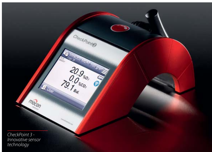
CheckPoint 3 - Innovative sensor technology